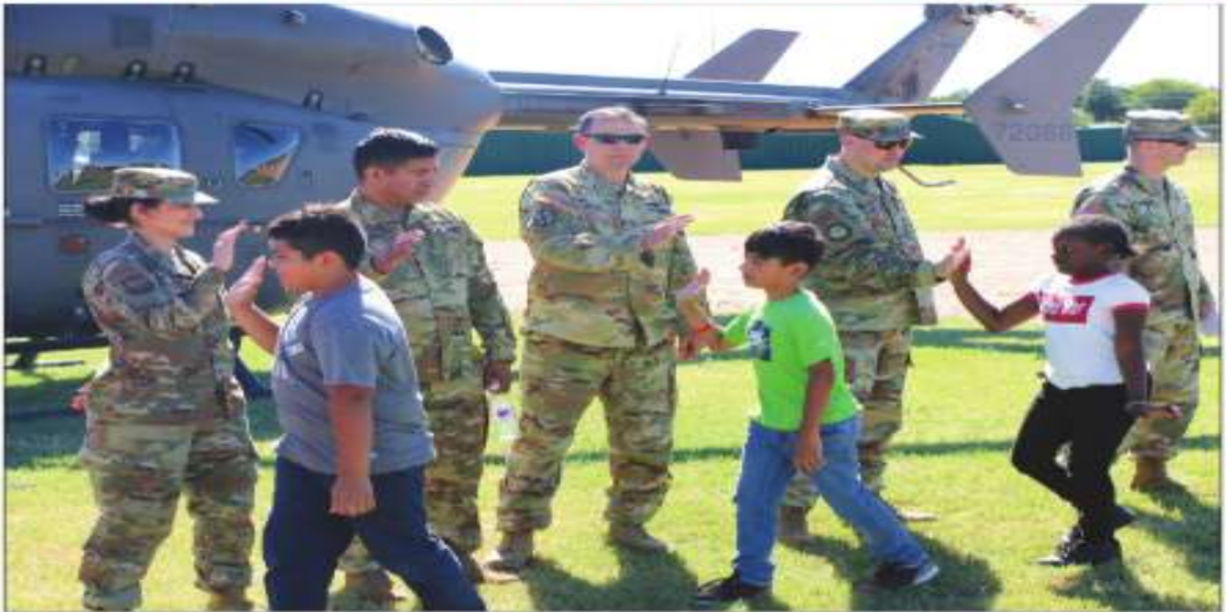
Military personnel greet students at MSI after landing in a helicopter for Red Ribbon Week.