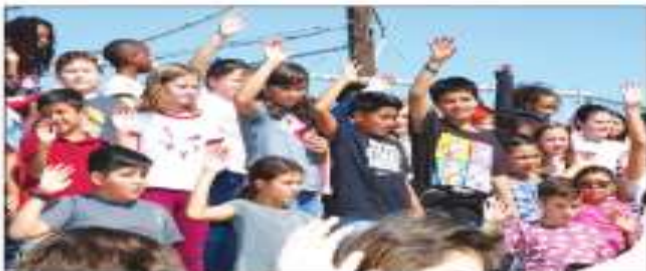
MSI students pledge to be drug free during a program presented by agents from the Texas Joint Counterdrug Task Force and the Drug Enforcement Agency.

helicopter land, and then military personnel as well as agents from the Texas Joint Counterdrug Task Force and the DEA exited the aircraft to present a program.